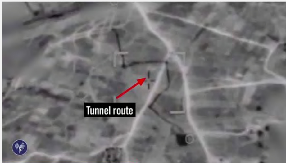
The route of the tunnel exploded by the IDF (IDF Spokesman, July 30, 2014) Click https://www.youtube.com/watch?v=ztzMkKSvSKo for the video.