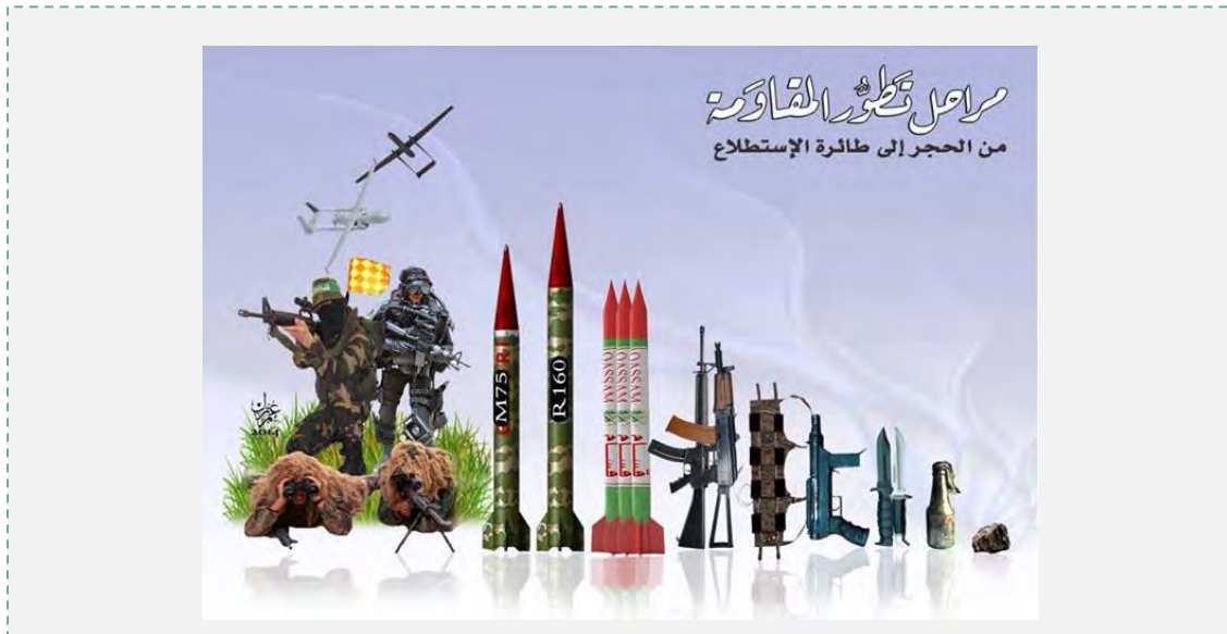
Poster showing the stages of the development of the "resistance," from the rock to the UAV