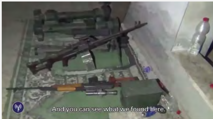
Weapons found in a mosque in the Gaza Strip Click https://www.youtube.com/watch?v=aWkjwfkx-qM for the video.