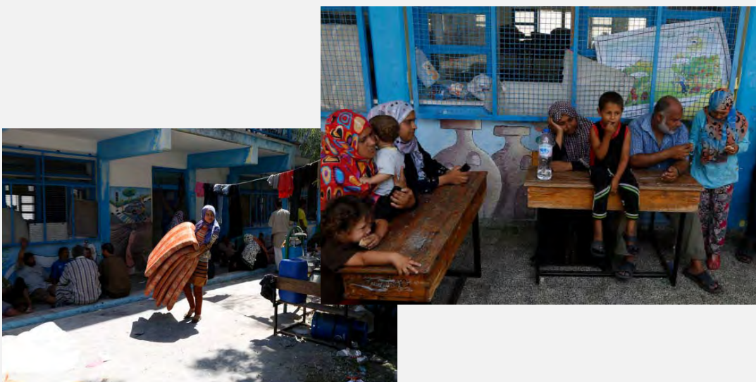
Gazans who found shelter in UNRWA schools (Wafa.ps, July 30, 2014).

19. Valerie Amos, UN Under-Secretary-General for Humanitarian Affairs and Emergency Relief Coordinator, reported that 250,000 Gazans had vacated their houses. Of them, 200,000 had sought shelter in UNRWA installations. She said the UN's World Food Programme supplied emergency food assistance to 204,000 people, in addition to its regular food programs (Reliefweb.int, July 30, 2014). 2