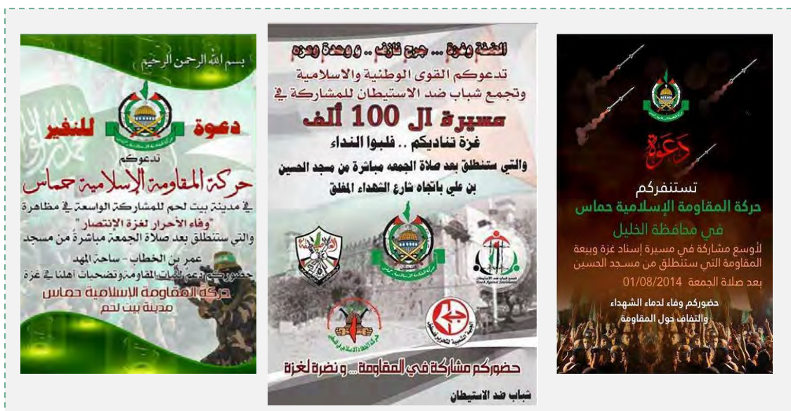
Notices calling on Palestinians to demonstrate. Left: Invitation to a demonstration in Bethlehem. Center: Call for the "March of 10,000." Right: Invitation to a demonstration in Hebron