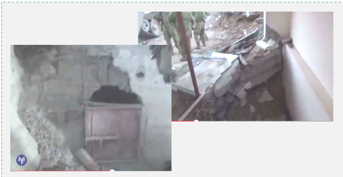
Tunnel openings exposed in a mosque in the Gaza Strip Click https://www.youtube.com/watch?v=5r6AYUy-ujo for the video.